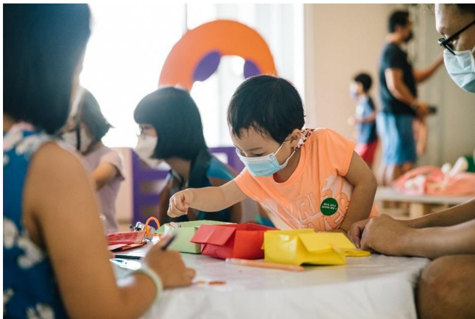
Visitors partaking in SAMily Funday programmes at the museum.

Perfect for family bonding, SAM is delighted to present a myriad of diverse and exciting art activities that are thoughtfully designed to encourage children to ask questions, explore new hands-on ideas, and expand their creative thinking. Programme highlights include: