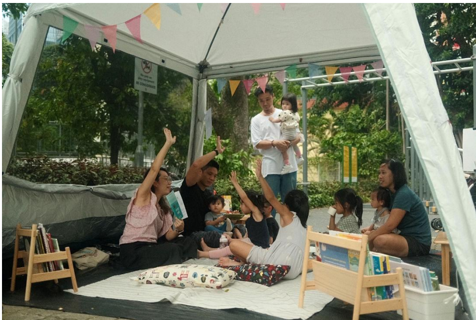
Visitors partaking in Natventure's 'A Roving Pop-up Children's Bookstore' programme, as part of SAM's public art initiative, The Everyday Museum.

The Everyday Museum, SAM's public art initiative, has recently launched two new public art trails, Portraits of Tanjong Pagar: Encounters with Art in the Neighbourhood and Singapore Deviation: Wander with Art through the Rail Corridor . Featuring a series of free public art installations that invite new ways of experiencing everyday spaces, families can embark on a self-guided journey through the Tanjong Pagar neighbourhood and the Rail Corridor to discover the art and learn new stories and perspectives about seemingly familiar places.