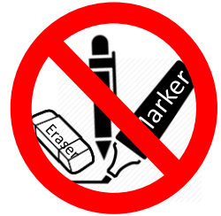
NO WET WRITING MATERIALS / ERASERS