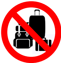
NO LARGE BAGS / BACKPACKS / LUGGAGES

Please deposit at our lockers, if they are larger than: 40cm (width) x 35cm (height) x 15cm (depth)