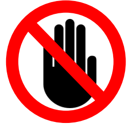
DO NOT TOUCH ARTWORK