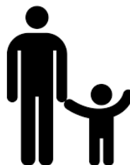
ATTEND TO CHILDREN