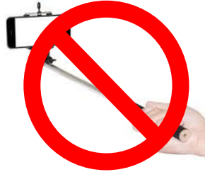
NO SELFIE STICKS