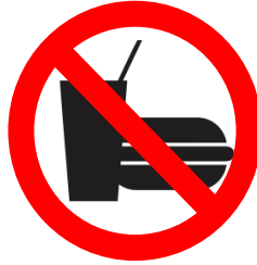
NO FOOD AND DRINKS