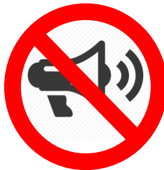
NO AMPLIFIER / SPEAKER

Please deposit at our lockers, if they are larger than: 40cm (width) x 35cm (height) x 15cm (depth)