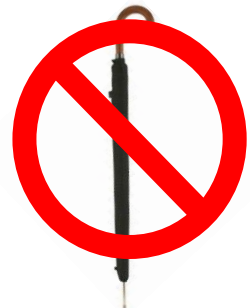
NO LONG UMBRELLAS