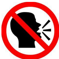
BE CONSIDERATE & SPEAK SOFTLY