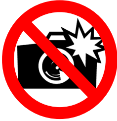
NO FLASH PHOTOGRAPHY

Please help us preserve our national treasures by observing the following etiquettes: