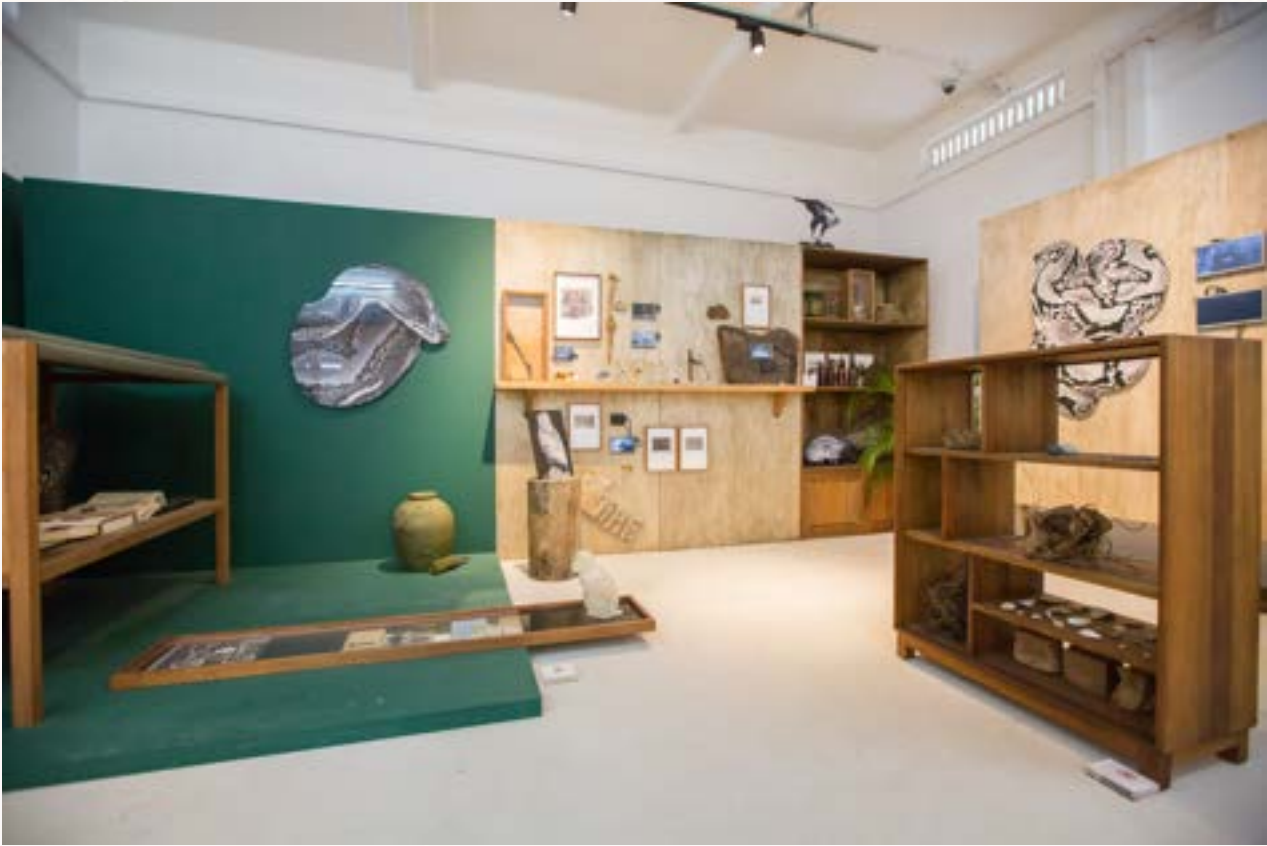
Installation view of Queen's Own Hill and its Environs , 2019.