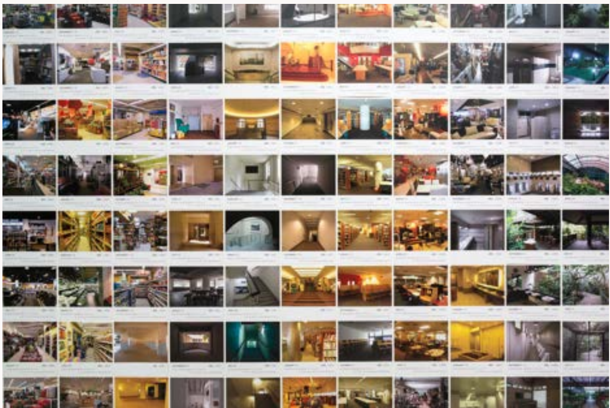
Installation view of Calendars (2020–2096), 2004–2010.