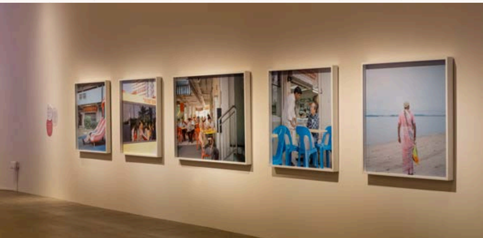
Installation view of Untitled, from the series Singapore, 2011-2013.