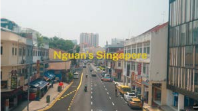
Stills from Learning Gallery | Nguan's Singapore, 2024.